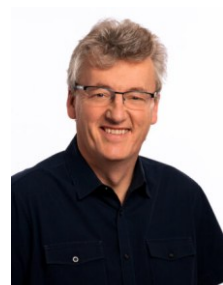
David MacMillan* Princeton University USA