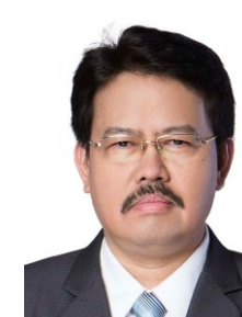
Jumina Gadjah Mada University Indonesia